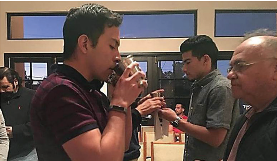
El Paso Catholic Students receiving the Eucharist during a vigil mass after the tragic events of August 3rd.