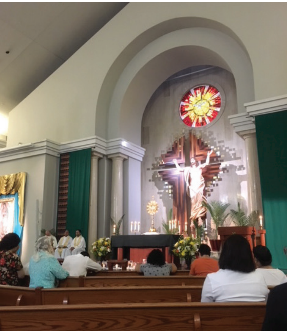
Parishioners at St. Mark Gather for a Holy Hour in memoriam for the tragic events of August 3rd.