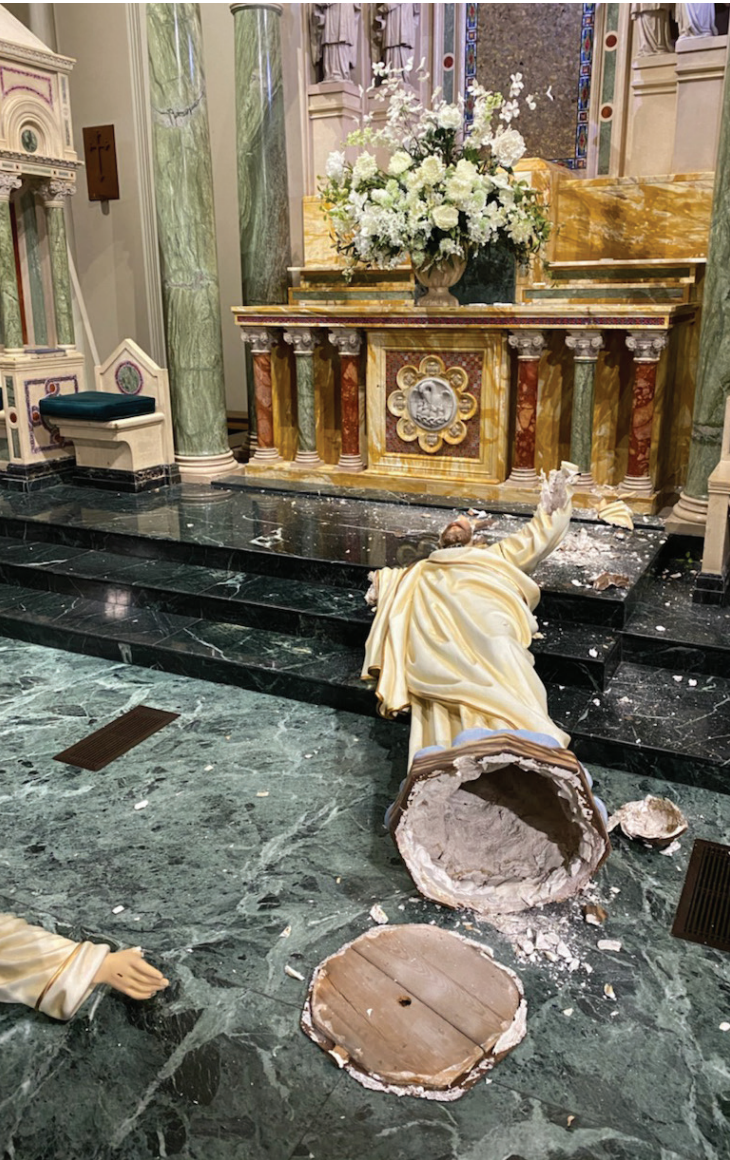
St. Patrick’s Cathedral was vandalized on the morning of September 15, around 10:00. A suspect entered and destroyed the nearly 90-year-old statue of the Sacred Heart of Jesus. The church was open and available for prayer.

The parish urged people to “pray for the person who did this, that they may get the help they need,” and said the vandalism was an “unfortunate situation.”