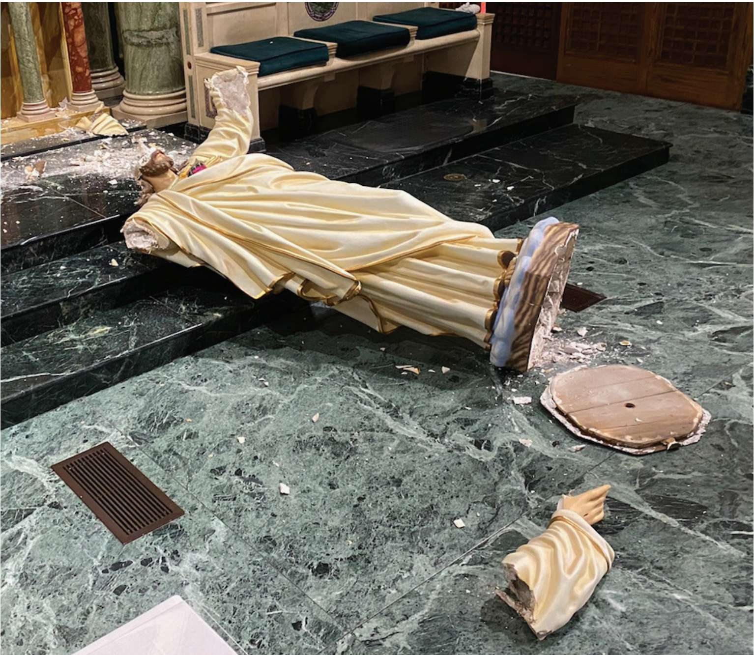
The Cathedral of St. Patrick was vandalized on the September 15th in the morning at around 10:00am. A suspect came into the sanctuary at St. Patrick Cathedral and destroyed the almost 90-year-old statue of the Sacred Heart of Jesus, which was located in the center behind the main altar of the church. The church was open and available for prayer.

"Sometime last night our statue of St. Therese of the Child Jesus outside of the Main Church was broken and vandalized. We are currently in contact with the police," the parish wrote on its Facebook page on Monday, September 14. The statue was pushed off its pedestal and the head was broken off. A planter by the statue was also smashed.