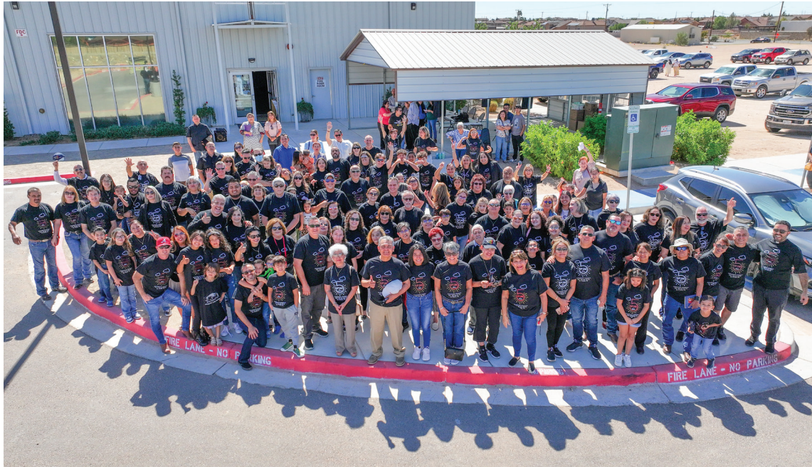
Joyful hearts and souls unite as parishioners commemorate the 5th Anniversary of the Parish of San Pedro de Jesús Maldonado since its founding on August 6th. Photographed here after the 12pm mass with special t-shirts printed to honor its founding 5 years ago.